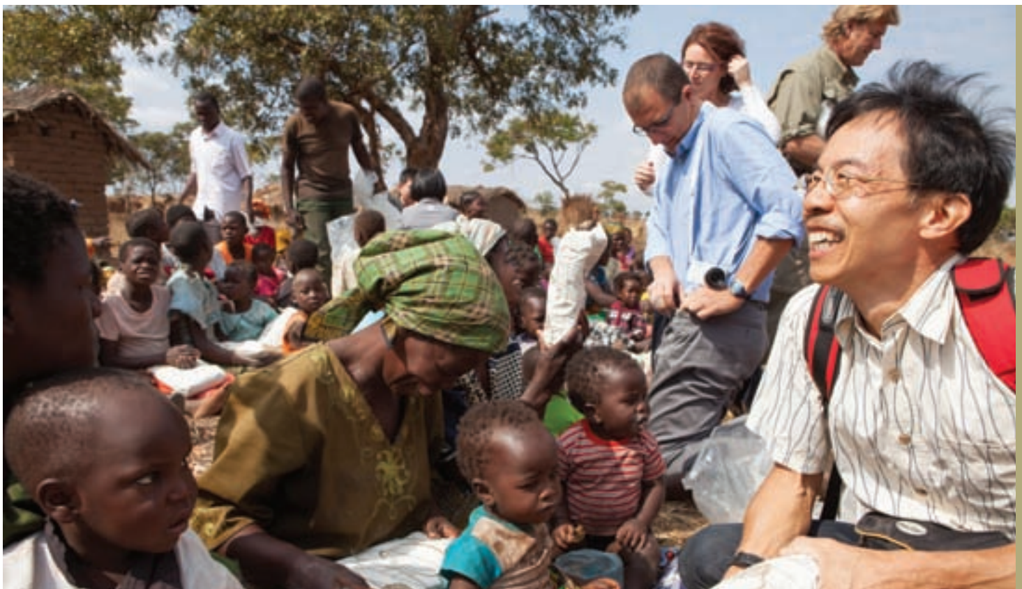
NOURISH THE CHILDREN

Nourish the Children applies the power of our distribution network to help address the problem of hunger and malnutrition. Nu Skin encourages distributors, customers, and employees to purchase VitaMeal and donate it to charitable organizations that specialize in distributing food to alleviate famine and poverty. As distributors incorporate VitaMeal into their business, they not only help grow their business, but also help children around the world grow strong and healthy.